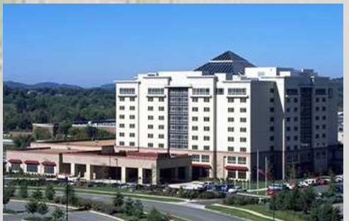
Embassy Suites Hotel Nashville-South/Cool Springs