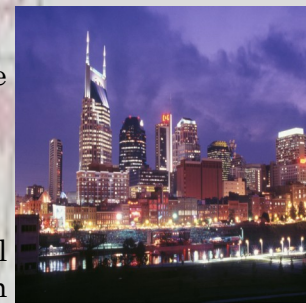
The Music City, Nashville

Bengali Association of Greater Nashville (BAGN) is excited to host the first Regional Bengali Conference , the Ancholik Banga Sammelan , from July 16-18, 2010 at Embassy Suites in Franklin, Tennessee, a southern suburb of Nashville.